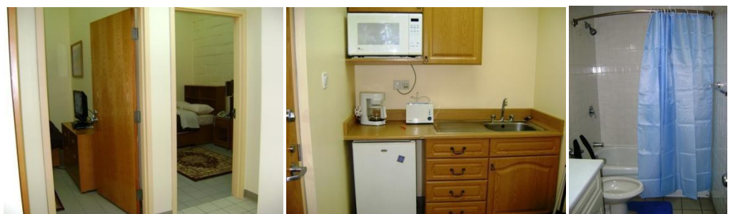
Two Individual Rooms Share a Common Bathroom and Kitchenette

• Personnel arriving in a TDY or TCS status will be billeted in Containerized Housing Units (CHUs) IAW AR 420-10. Although most CHUs in theater are exposed to the elements, CAS houses its CHUs inside an external structure to improve quality of life for its Soldiers. Bathrooms, showers, and laundry machines are shared. A free, contracted laundry service is also available. Depending on your rank, you will be either in an individual or shared CHU.