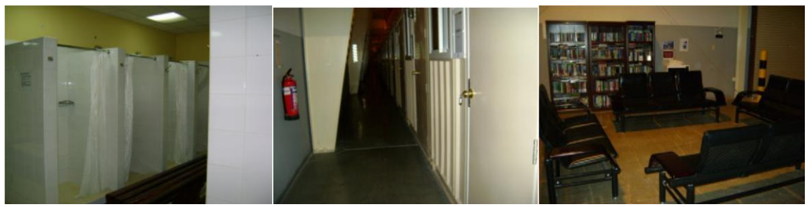
Examples of a Shower Stalls, a Hallway of CHUs, and a Common Area