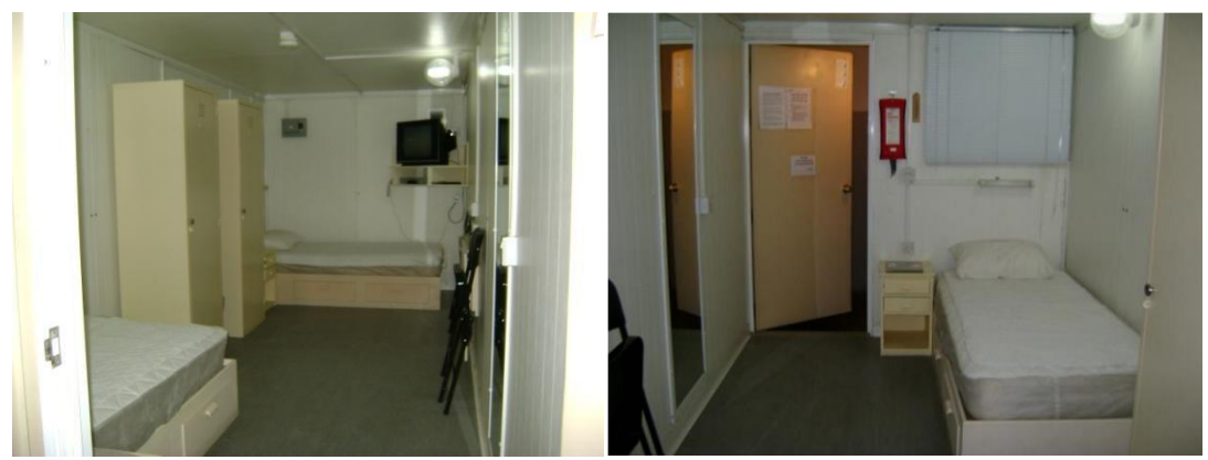
Example of a Shared CHU